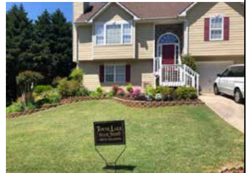
CENTENNIAL PLACE 616 Lexington Way