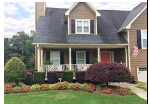
CENTENNIAL PLACE 4077 Mount Vernon Drive