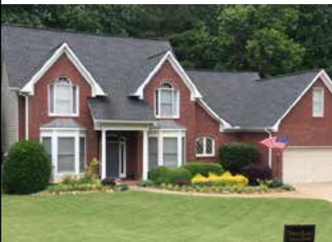
PROVIDENCE PLACE 2019 Providence Walk