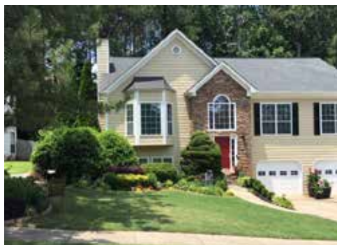
TOWNSHIP PLACE 2030 Township Drive