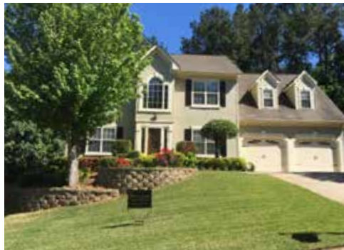
TOWNSHIP PLACE 2027 Township Drive