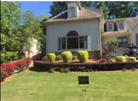
PROVIDENCE PLACE 302 Providence Point